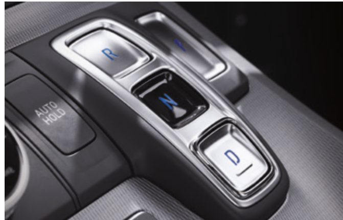
8-speed shift-by-wire automatic transmission