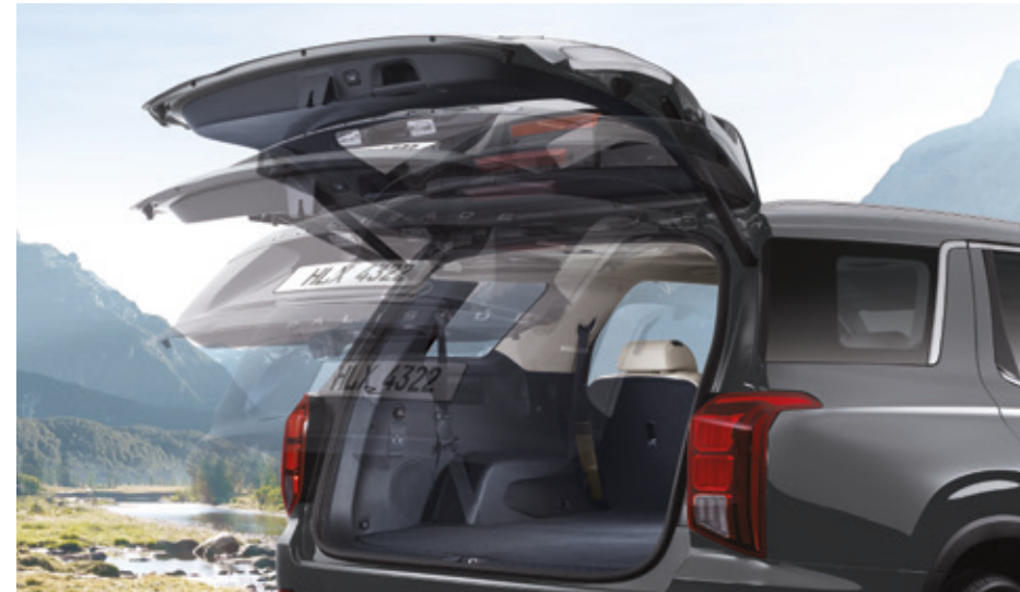
Smart power tailgate