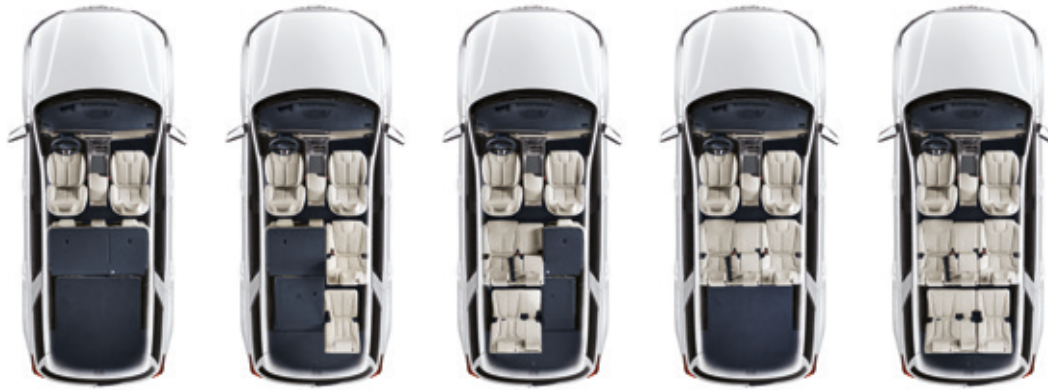
2nd and 3rd row folded