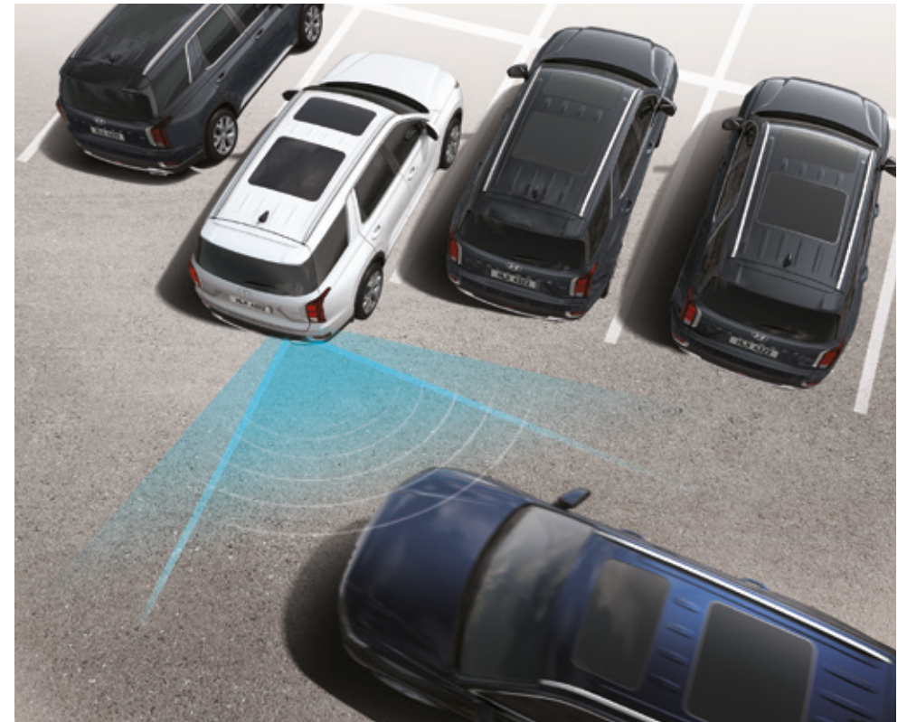
Rear Cross-Traffic Collision-Avoidance Assist (RCCA) Radar sensors in the rear bumper monitor cross traffic approaching from left and right side of the vehicle during reverse maneuvers, and if necessary the system will apply warning and emergency braking to prevent from collision (RCCA).