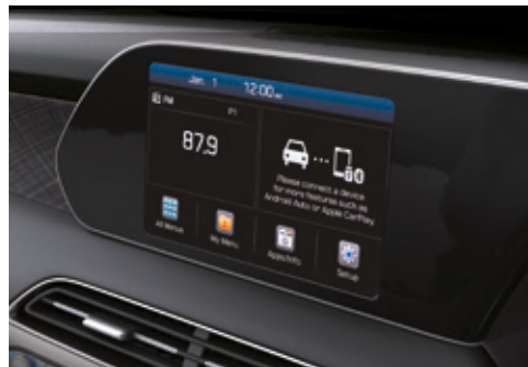
8" Touchscreen infotainment system with wireless apple carplay® and android® auto