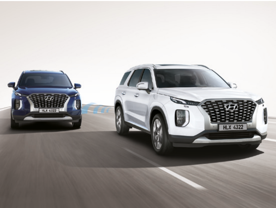
Blind-Spot Collision-Avoidance Assist (BCA)* and Blind-Spot Collision Warning (BCW)** Radar sensors in the rear bumper are used to warn the driver of approaching vehicles in the blind spot area.

With Hyundai SmartSense™, our cutting-edge Advanced Driver Assistance Systems, Palisade is equipped with the latest active safety technologies built to provide you with more safety and peace of mind.