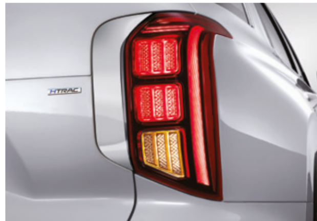
LED rear combination lamp