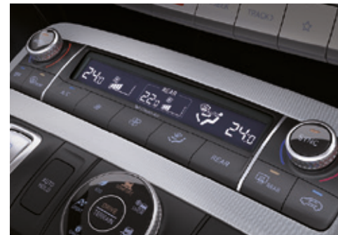
Three-zone full auto air conditioning system