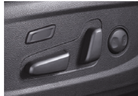
Driver's 12-way power seat