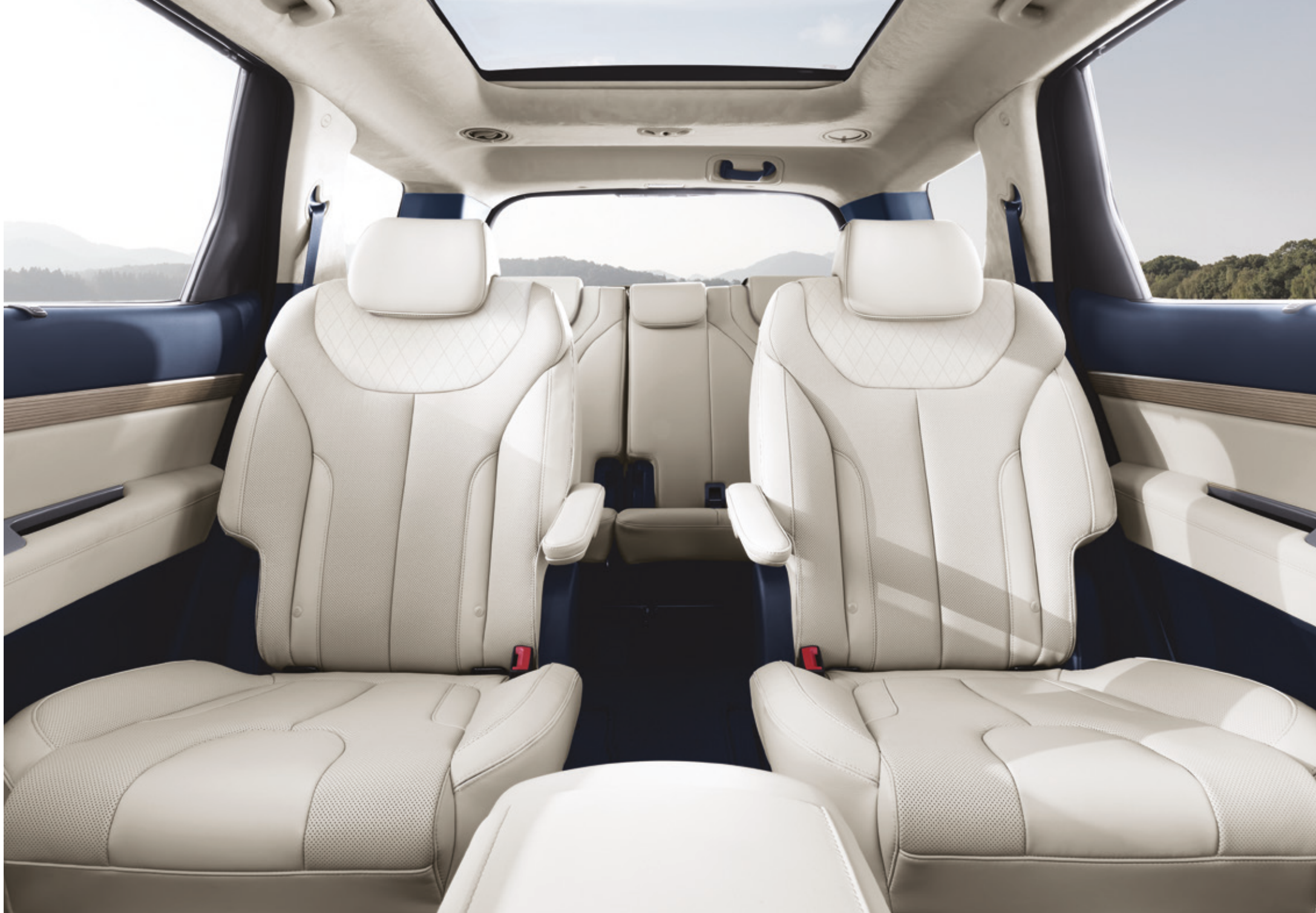
Pictures are for illustration purposes only. Actual units may differ. Terms & conditions apply.