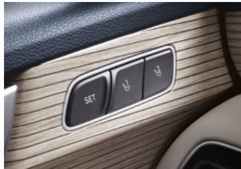
Integrated memory system (IMS) (driver only)