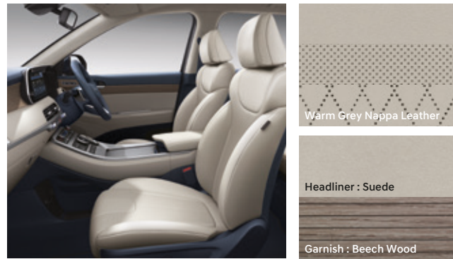
Warm Grey Interior