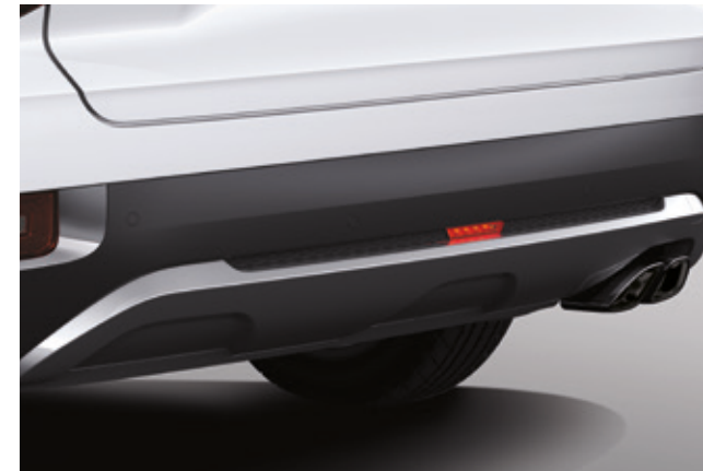
LED rear foglamp