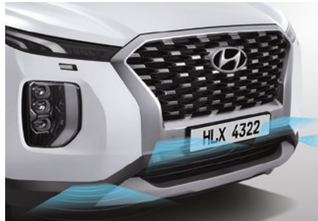
Front / rear parking distance warning