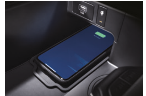
Wireless phone charging (WPC)