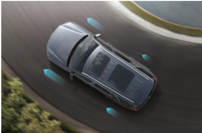
HTRAC HTRAC All-Wheel Drive*

295 Maximum power PS/6,000rpm 355 Maximum torque Nm/5,200rpm