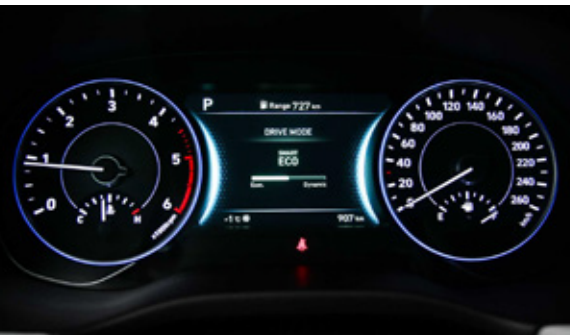
7" TFT LCD instrument cluster