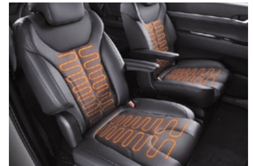
Heated and ventilated seat (2nd row)*