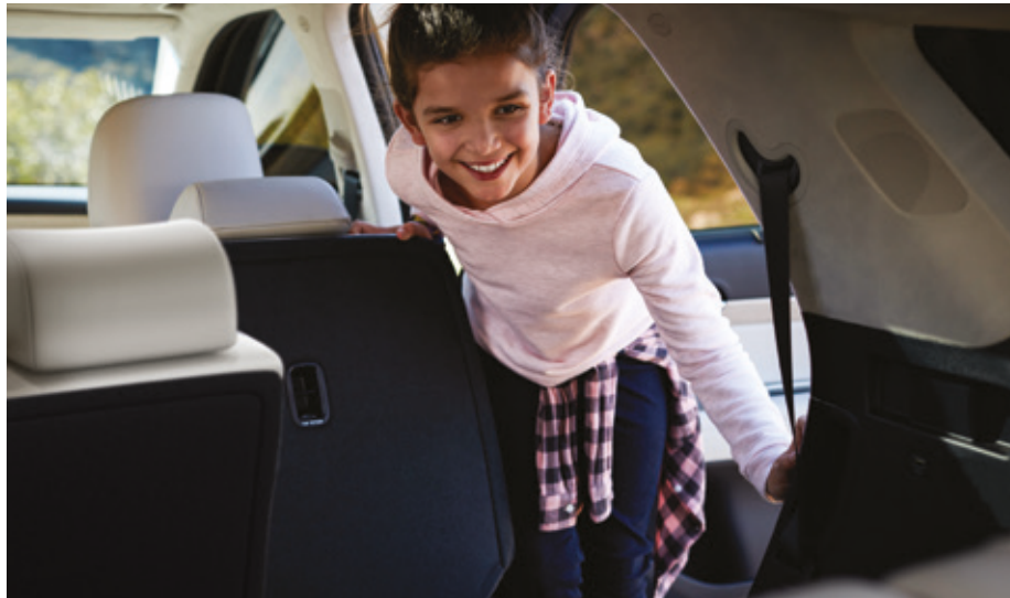
Smart one-touch walk-in button

For added convenience, the second-row seats include a smart one-touch walk-in button that instantly readjusts the second-row seat position for easier third-row entry/egress. Rear seat passengers will also appreciate the dual-wide sunroof that brightens up the interior.