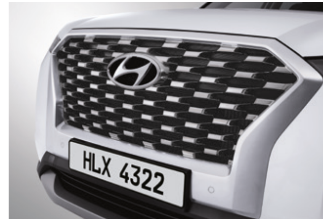
Black & silver paint radiator grille