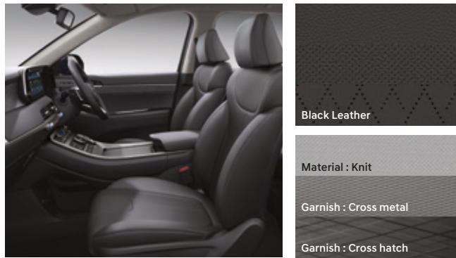
Black Mono-tone Interior